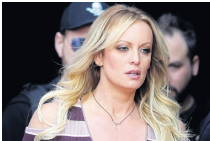
Adult film actress Stormy Daniels arrives for the opening of the adult entertainment fair Venus in Berlin, on Oct. 11, 2018.